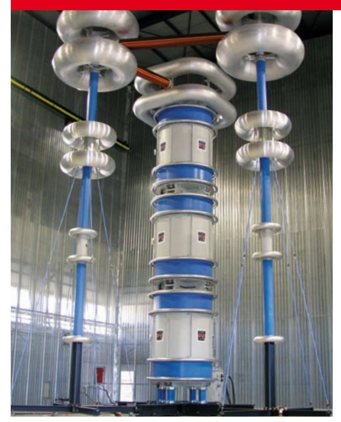
Fig. 1 HVAC resonant test system type WRM