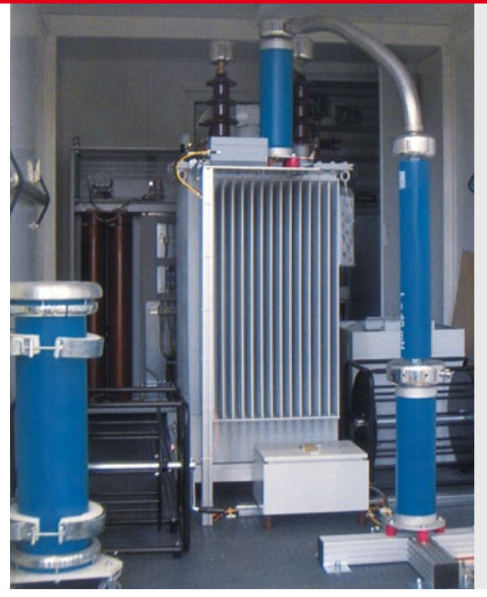
Fig. 2 Portable HVAC resonant test system type WR container variation