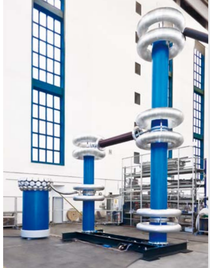
Fig. 2 HVDC power supply type GE 200/900