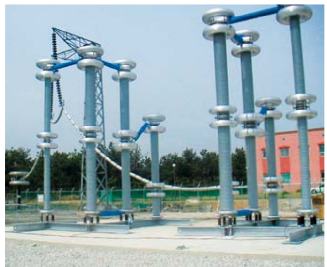
Fig. 4 Double-pole 600 kV outdoor HVDC test system type FGP 200/600

Note: The HVDC power supplies do not need to fulfill voltage shape requirements (e.g., ripple) based on the standard IEC 60060-1.