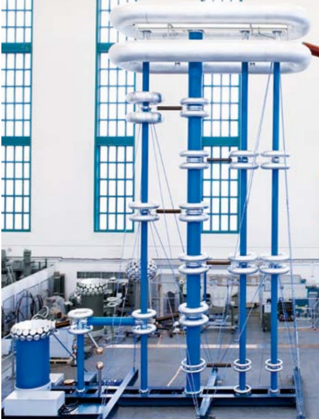
Fig. 1 HVDC test system type GP 50/2000