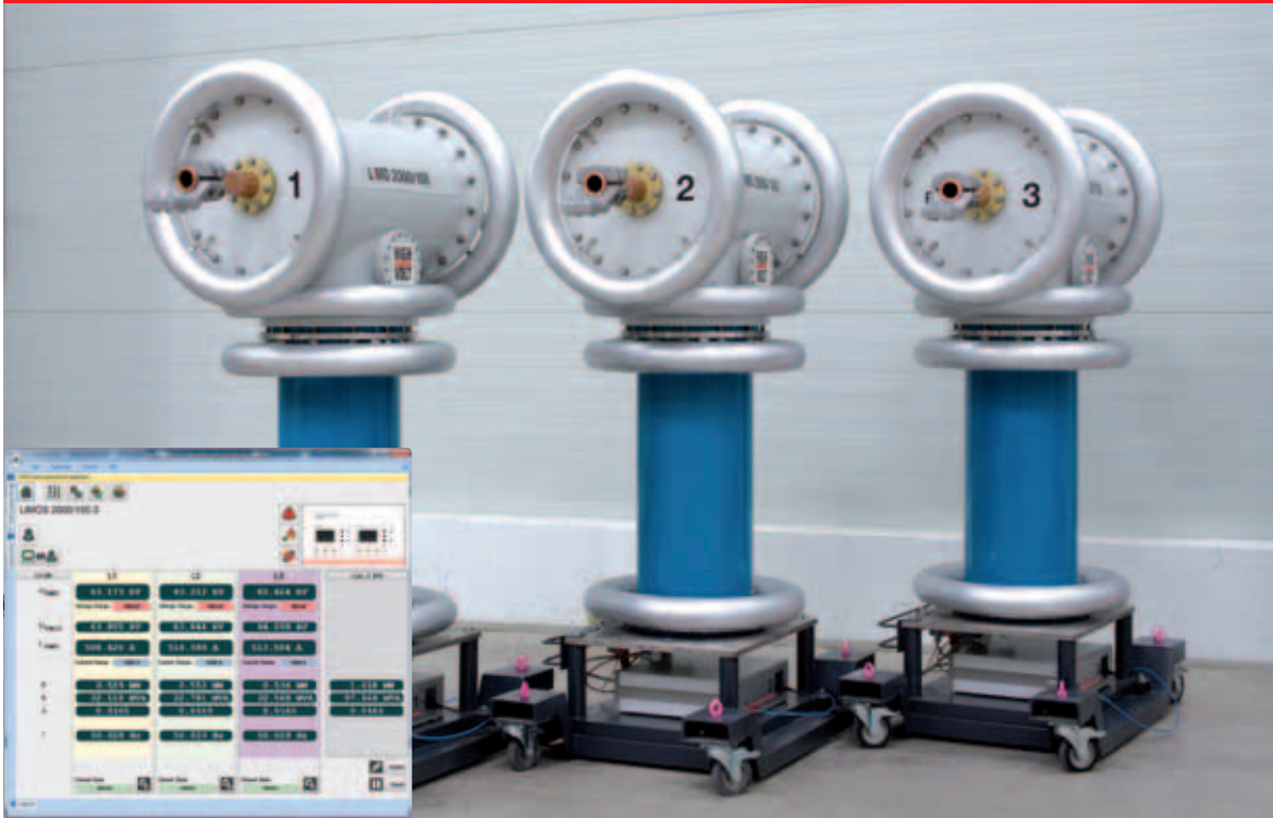
Fig. 1 LiMOS 2000/100 consisting of three sensors with Measuring and Transmitting Units (MTU) and the remote screen