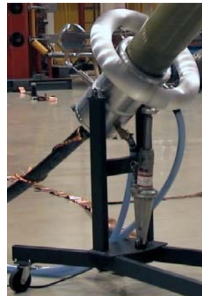
Fig. 2: CET 300/120 with manual jacking system

The termination CET is designed as a 2-tube system in which the deionised water circulates. Together with the water conditioning unit a closed water system is formed. Each cable termination is connected by two hoses to the water conditioning unit, see title figure.