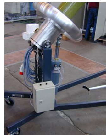
Fig. 3: CET 300/120 with motorized jacking system

To lift the CET a standard version with manual jacking system, Fig. 2, is available. The motorized version, Fig. 3, is offered as an option.