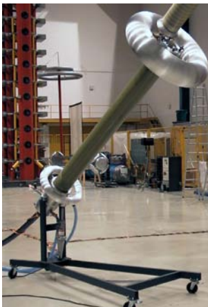
Fig. 1: View of a cable end termination for 300 kV, CET 300/120

The CETS series includes terminations from 100 kV up to 800 kV for a maximum cable diameter of 160 mm over the outer semi-conducting layer. Cable end terminations are based on the field control within the end termination and in the ambient air by using water with a specific and adjustable conductivity. Due to the concept of the fully automatic control of the conductivity, the temperature as well as the filling and emptying process, the cable end termination systems are perfectly suited to perform all above mentioned tests. They were developed in such a way that they can be delivered as fully automatic stand-alone systems. The great advantage for the user is a comfortable and easy integration into the existing control and measuring system of the HV test equipment via a fibre optic link.