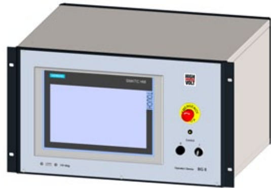
Fig. 1 Operator device HiCO Basic