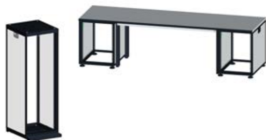
Fig. 6 Housing types: operator rack (left) and operator board (right)