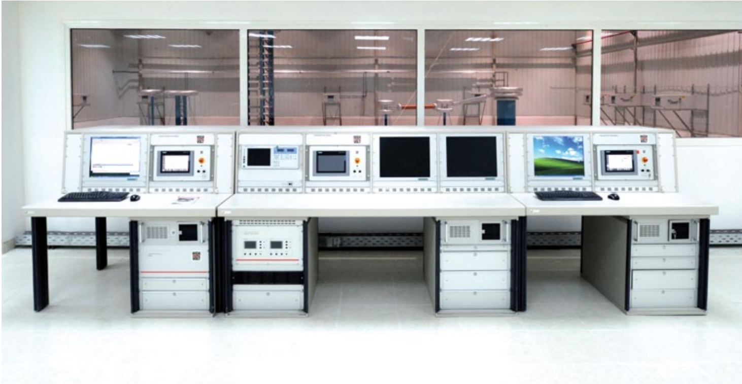
Fig. 7 Control room with operator desks (OD) of a transformer test bay with several high voltage test systems