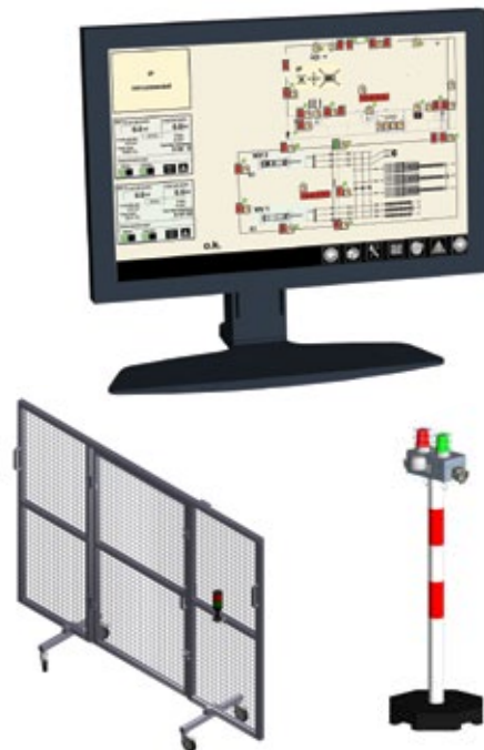
Fig. 5 Safety measures: test bay visualization (top), safety guard (left), safety column (right)