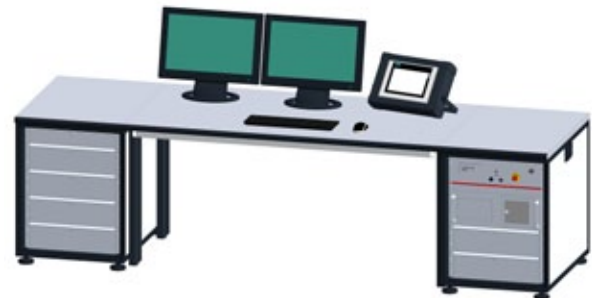
Fig. 2 Operator board containing the advanced control